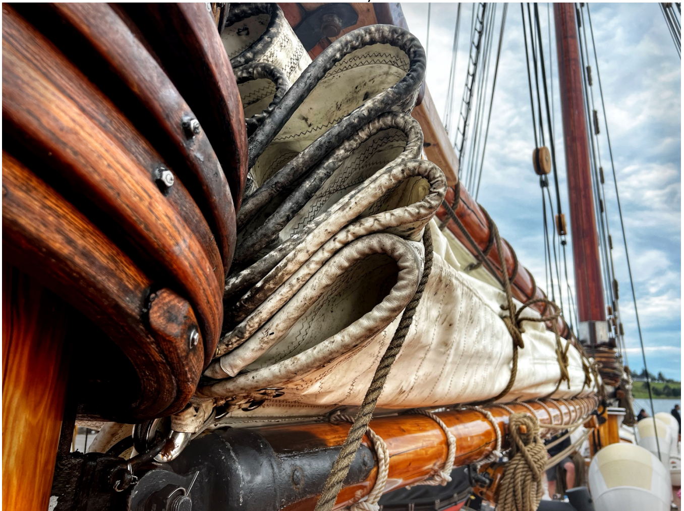
"Bluenose Sails" by Viki Gaul