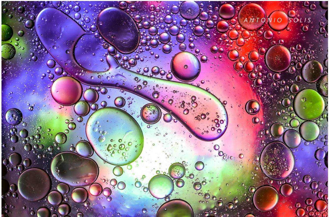
Oil and Water by Antonio Solis