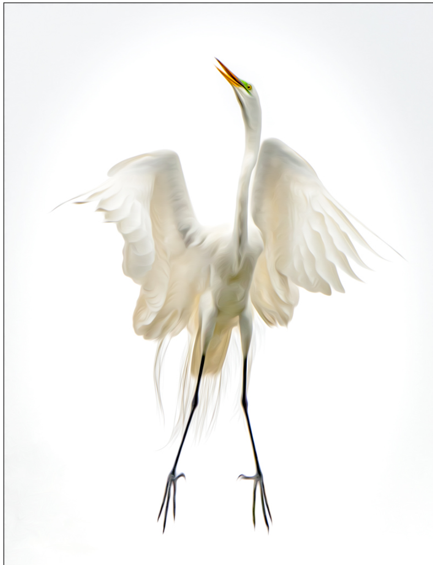
'Egret Upward Flight' by Fred Greene

Colour Print Sapphire Award, Monochrome Print Topaz Award, CPID Galaxy 6 Award, Nature Diamond Star Award, Photojournalism 4 Star Award, Photo Travel 3 Star Award