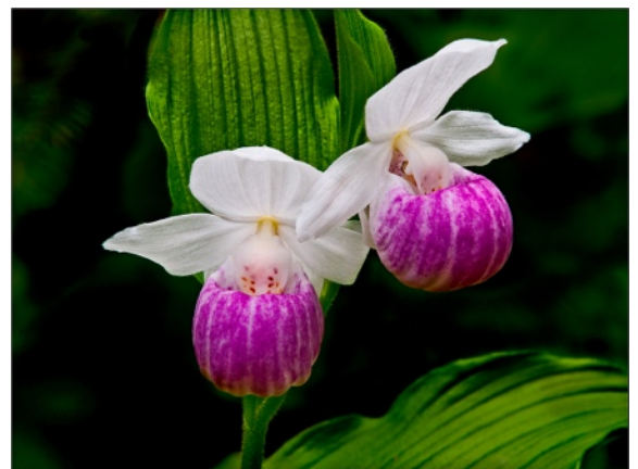
Best Wildflower Image: Showy Ladyslipper 4563, Fred Greene