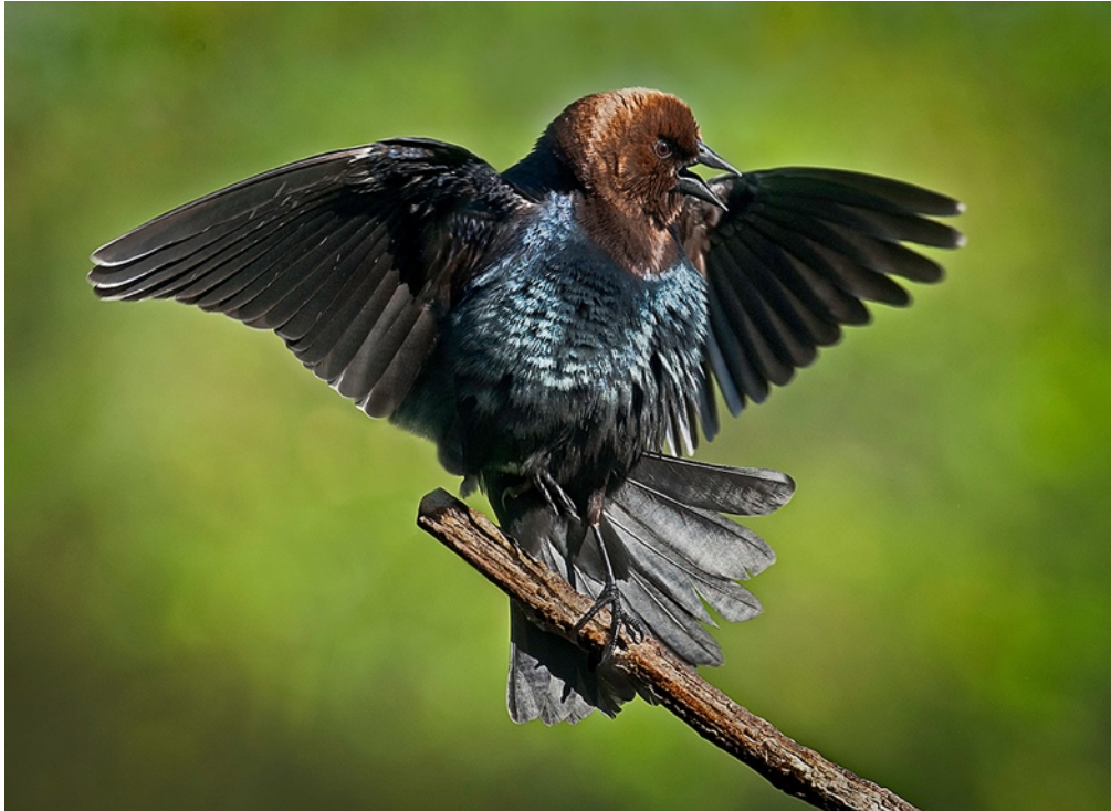
1st Place Male Cowbird Displaying Viki Gaul