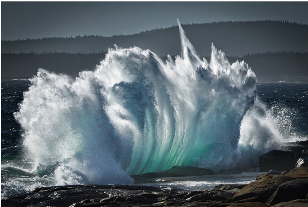
2nd Place: Hurricane Irene Surf, Whaleback, NS, Colin Campbell