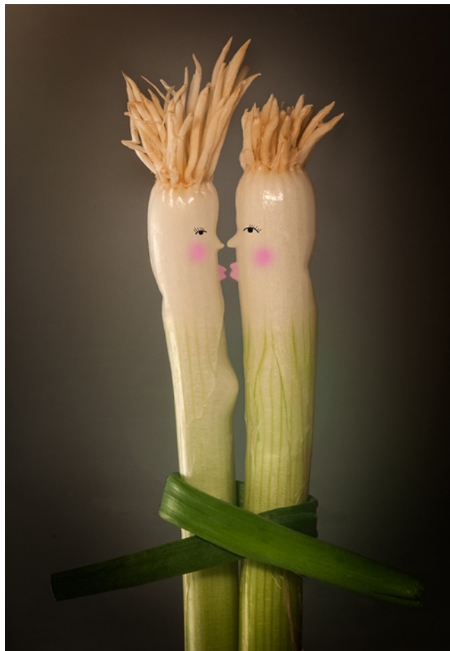
2nd Place Love in the Crisper Viki Gaul