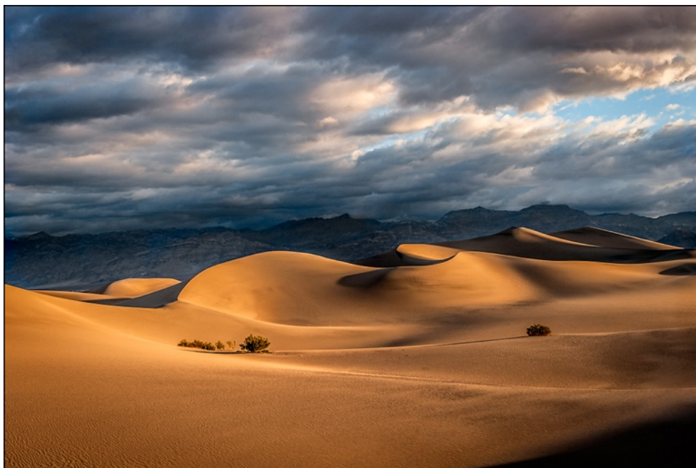
1st Place: Dunes, Fred Greene