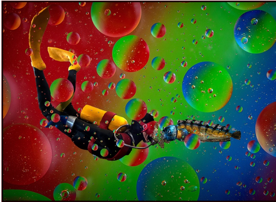
1st Place Diver Meets Fish Viki Gaul