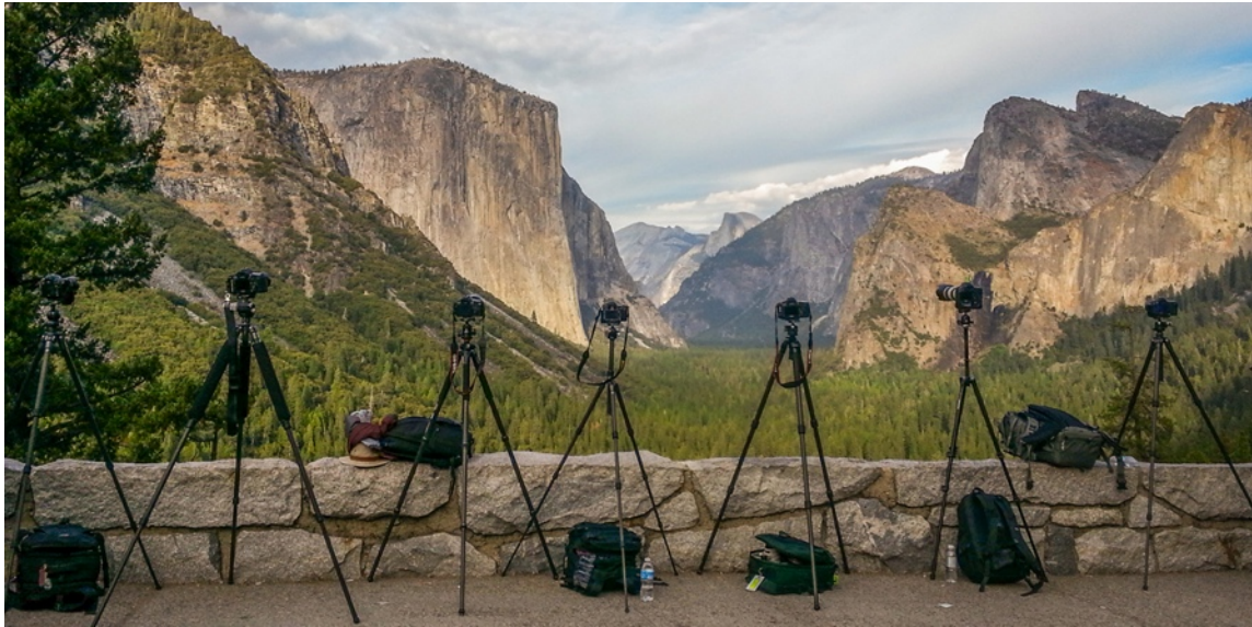
1st Place; Waiting for the Light, Colin Campbell